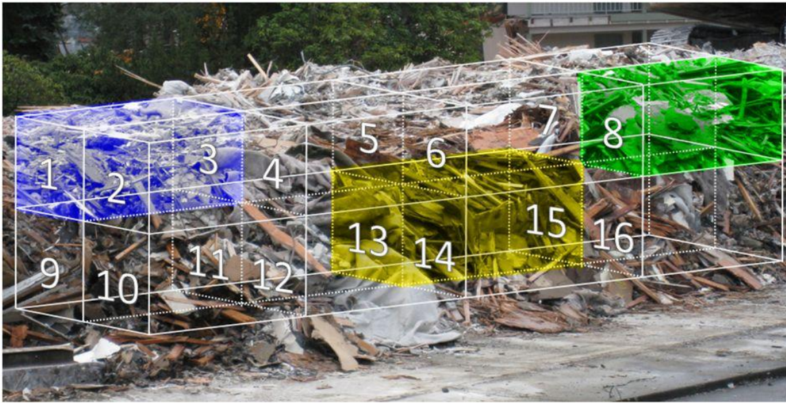
Figure 2. Visual overlay for Direct Load Method showing “cells” of material